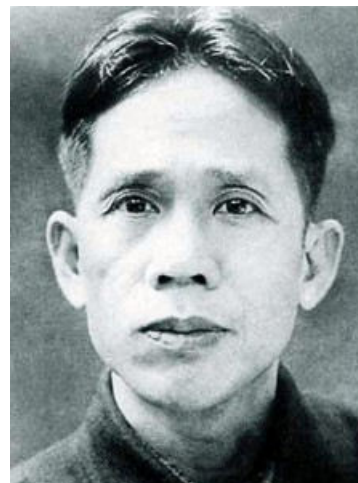
Le Duan – Leader of the North Vietnamese 1975

known as the Gates of Heaven and Hell. 1 People who have this combination are said to have something like a sixth sense and can instinctively know when to act and when to wait. In addition, Le Duan was in good luck at this time compared to the luck of President Ford. With the Yin Fire sitting on the Metal of the Rooster, his fire was further strengthened, acting as the Power element to the Metal, helping to propel him to the High Office of Secretary General. This was the opposite of Ford, who was by contrast, controlled by his double Power element of Yang Water on the Rat.