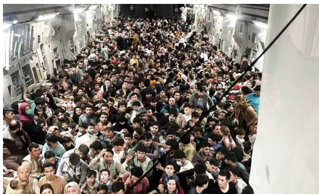
Afghani refugees piled aboard an American aeroplane, escaping the Taliban August 2021.