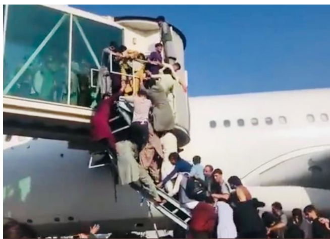
Kabul International Airport August 2021.

Scenes of absolute desperation to escape the incoming Taliban government can be found in such images: