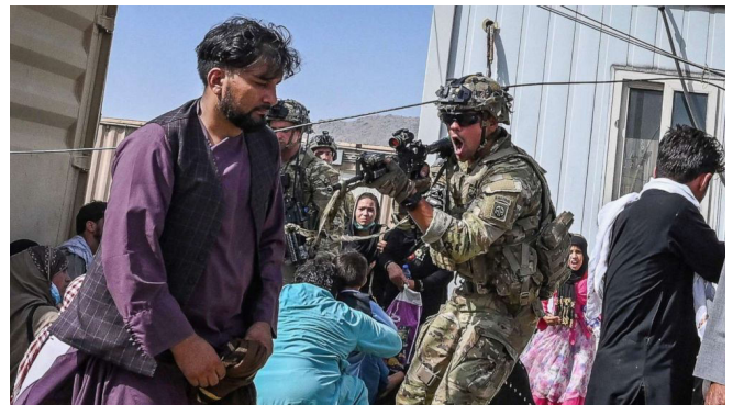
Temper flare at Kabul Airport August 2021

Which makes me think the Taliban and Isis-K would now do well to heed Churchill's words: “Those who can win a war well can rarely make a good peace, and those who could make a good peace would never have won the war.”