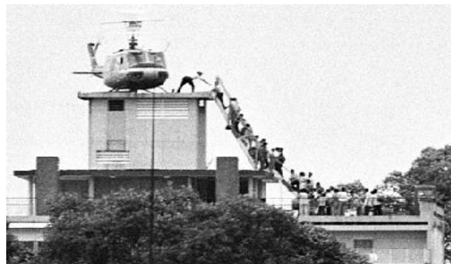
Perhaps the most enduring image of the fall of Saigon 1975?

What I wonder will be the most enduring image of the American retreat from Afghanistan?