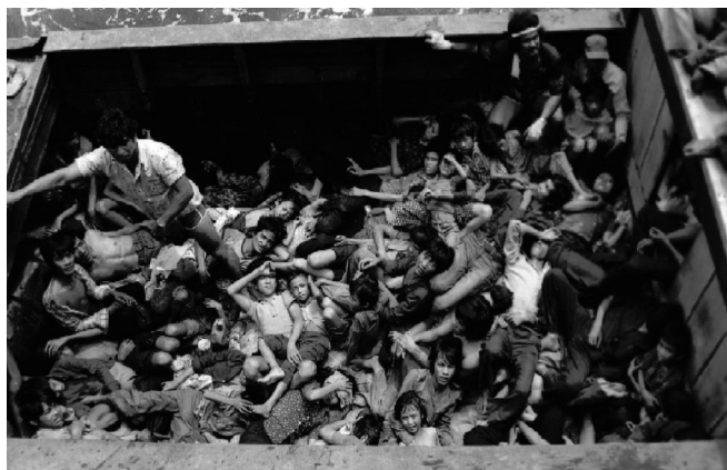
Vietnamese refugees piled into a boat in order to escape the North Vietnamese Communists. 1975

Pictures this last week of the fall of Kabul as the USA withdrew their forces in what amounted to scenes of total chaos, were, despite the Pentagon's denials, in fact highly reminiscent of the fall of Saigon, 46 years ago. Indeed the similarities are manifestly obvious.