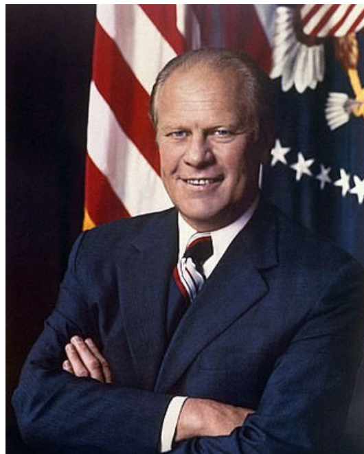
President Gerald Ford

Pillar of Yang Water sitting on the Rat, which is itself Yang Water, this Water is too strong and whilst it is deemed to be his power or conquering element, and is probably what propelled him forward to the Vice Presidency and then the Presidency, it is actually too strong and thus he is conquered in this period.