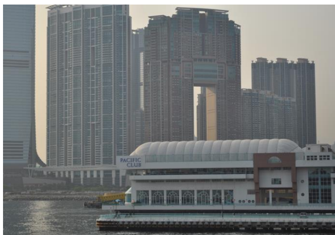
A Kowloon side building with large Dragon hole.

15 most expensive hotels in the world.) In fact many of the most modern buildings across the territory are being constructed nowadays with large dragon holes in them to accommodate the passage of the city's feng shui dragons.