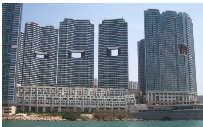
Hong Kong Harbour-side apartment buildings and their Dragon Holes. Image believed to be in the public domain.