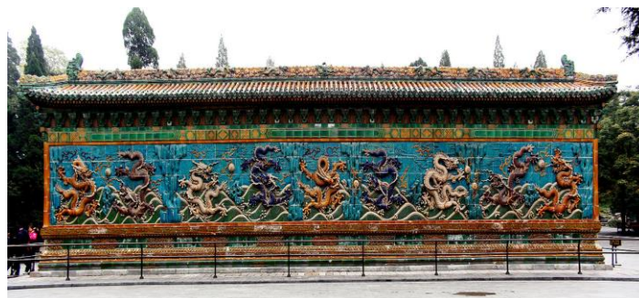
The famous 9 Dragon Screen in the Forbidden City Beijing

Apt precedents exist in Hong Kong, the feng shui capital of the world. In that dynamic, never-say-sleep city, I personally have observed how over the last 30yrs, the once wide and commodious harbour has been gradually filled-in more and more by land reclamations. Where once discreet grumblings of concern could be heard over the filling-in of the harbour on both Hong Kong Island and the Kowloon Peninsula by local feng shui experts, such worries are now being voiced far more frequently and openly. Especially concerning to them is the degree to which not only the harbour has been filled-in but also the positioning of yet more and more skyscrapers all along the shores of both Hong Kong and Kowloon. These now block the older, smaller buildings behind from having direct access to the water. In feng shui terms both factors are strangling the goose that lays the golden egg. This is just as applicable here in Auckland as Hong Kong.