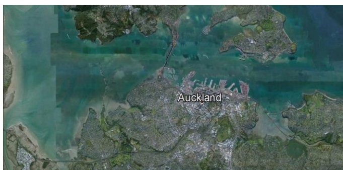
Auckland's Jade Belt enraps the city from Waterview and Avondale in the west to Hobson Bay in the east.

The Ports of Auckland's controversial plans for further wharf extensions into the Waitemata Harbour have Aucklanders and the port authority at logger heads. At issue is the proposed extension of yet more wharves and public's concerns over any associated narrowing of the harbour. Well known yachting identity Chris Dickson has been quoted by the New Zealand Herald as saying, " The harbour used to be 2000m wide. Now it was less than 1000m.... The same amount of water goes in and out as it always has but it is squeezed through half the space. That means the current has doubled. It's a rip. There are whirlpools. There are overfalls. It's dangerous ". (NZ Herald, 23rd March 2015)