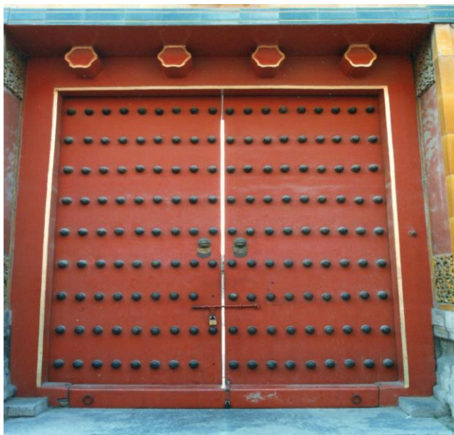
The 9 Sets of 9 ornamental studs found on all major gates in the Forbidden City and yet more signifiers of the Emperor.

significance in Chinese culture and was reserved almost exclusively as the Emperor's personal number. For example, in Beijing's Forbidden City; winter home to the Emperors, the number 9 and its multiples can be seen again and again as a leitmotif of the Son of Heaven. Perhaps the three most often quoted examples are the fabled 9,999 rooms said to make up the Forbidden Palace complex, the world's largest. The exquisite porcelain tiled nine dragon screen, is another. Furthermore, all major gates in the palace have nine rows of nine ornamental studs as their own particular imperial ornamentation; another artifice restricted alone to the Emperor's residences.