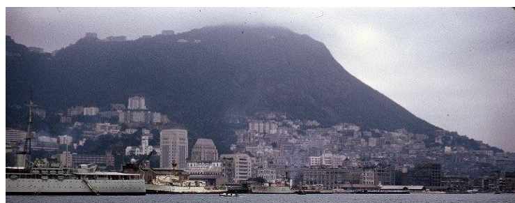
1950's Hong Kong Island Foreshore. (J Brixey) The Bank of China and HSBC then the only two notable buildings.