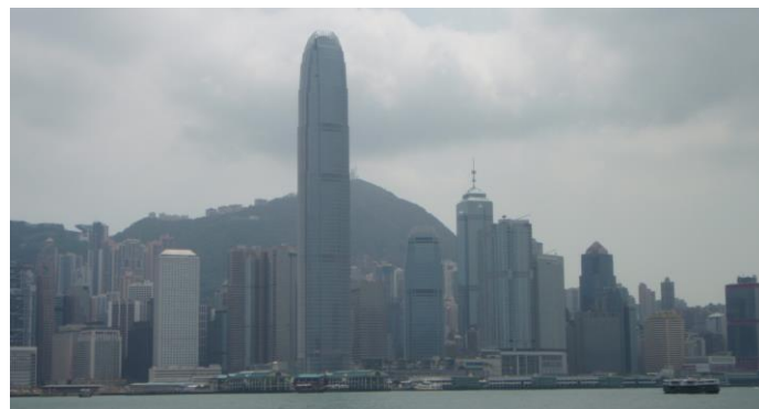
The same Hong Kong Island foreshore today with the tallest, most modern buildings now blocking the flow of qi. It's this 'blocking' that most concerns Hong Kong's feng shui masters.

Today however, what has feng shui masters in Hong Kong voicing their concerns is the veritable wall of waterside skyscrapers that now block many older buildings behind them. Indeed in the case of Kowloon; which incidentally translates as 9 Dragons, an open space has been decreed in law, to be kept in perpetuity, across the waterfront tip of the peninsula in Tsim Sha Tsui, so as to prevent any blocking of the dragons there from reaching and gambolling in the waters of the Harbour. Indeed so seriously do developers and hoteliers alike in Hong Kong take these dragons that when the Regent Hotel, (now the InterContinental) was built at the tip of the Kowloon Peninsula in 1980, extraordinary lengths were taken to maintain the presence of these dragons. Among other things a singular, and very extravagant waterfall was especially constructed in its lobby to attract the dragons to come play in its waters before going on to the harbour. (The hotel is listed, even now, as one of the