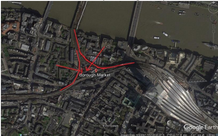
London's Borough Market, showing the Sha Qi pressing on the site.

The milk powder scandal in China in which doctored New Zealand milk products played a significant role, saw many young babies and infants made terribly ill, with many dying. The terrible toll on infants in conflicts in Syria and beyond, are all examples of how the Period of 8 impacts negatively on children.